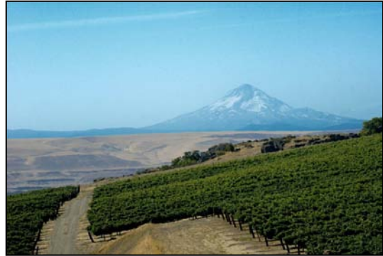
Gunkel Family Vineyards

Maryhill Winery is located in an exceptional microclimate for growing the highest quality wine grapes. With hot summer days, cool nights, moderate winters and a gentle maritime breeze, the area has been referred to as the “Mediterranean of the Northwest.” The area supports a wide variety of grapes – including several difficult-to-grow varieties often stunted in many of the region’s other vineyards. Maryhill produces 18 varieties and 27 total wines, showcasing the full breath of wines Washington state offers.